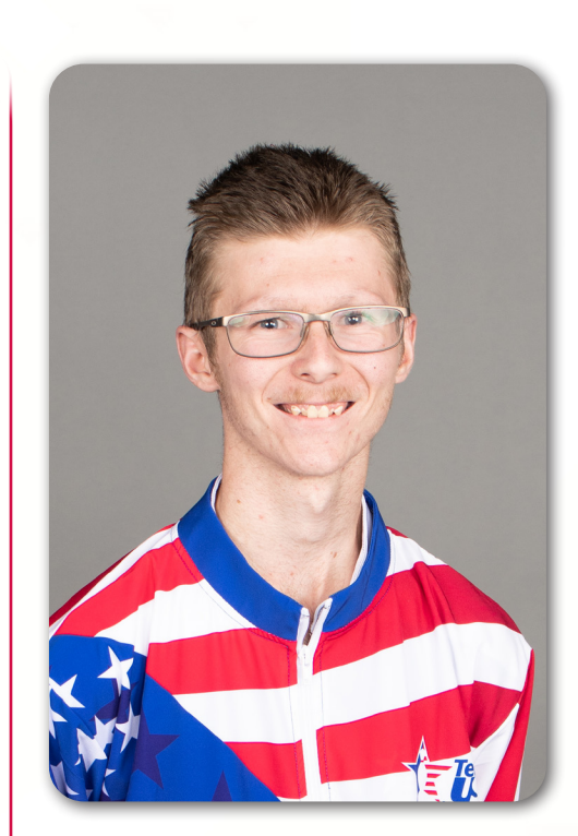
Junior Gold reserves the right to institute additional methods of entry into the Junior Gold Championships for those athletes who live in areas determined to be under-served by the current Junior Gold qualification process.