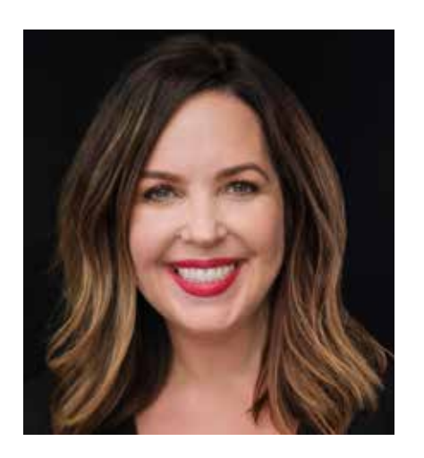
DIANDRA ASBATY SUPERIOR PERFORMANCE

The USBC Hall of Fame was created in 2005 by merging the former American Bowling Congress and Women's International Bowling Congress Halls of Fame. With the sixmember 2023 USBC Hall of Fame class, there are 452 USBC Hall of Famers – 230 in Superior Performance, 126 in Meritorious Service, 54 in Veterans, 22 in Pioneer and 20 in Outstanding USBC Performance.