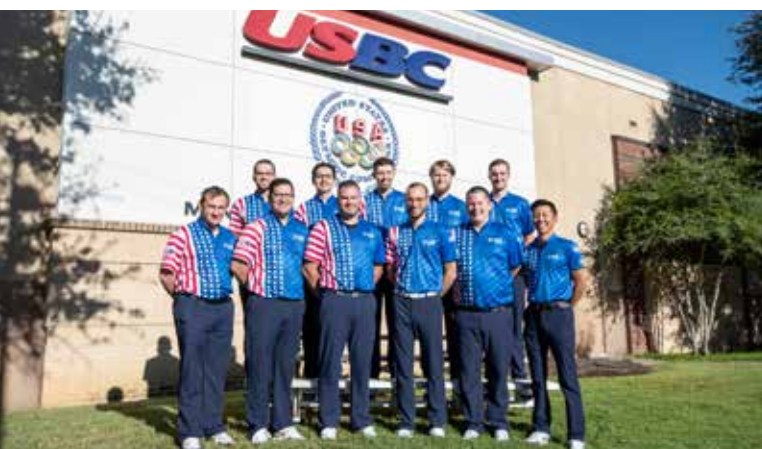
2024 TEAM USA MEN

red, white and blue as the 19-year-old right-hander brought home the women's silver medal. Street recorded an 11th-place finish for the Junior Team USA men.