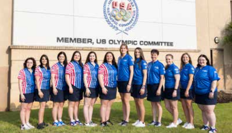
2024 TEAM USA WOMEN